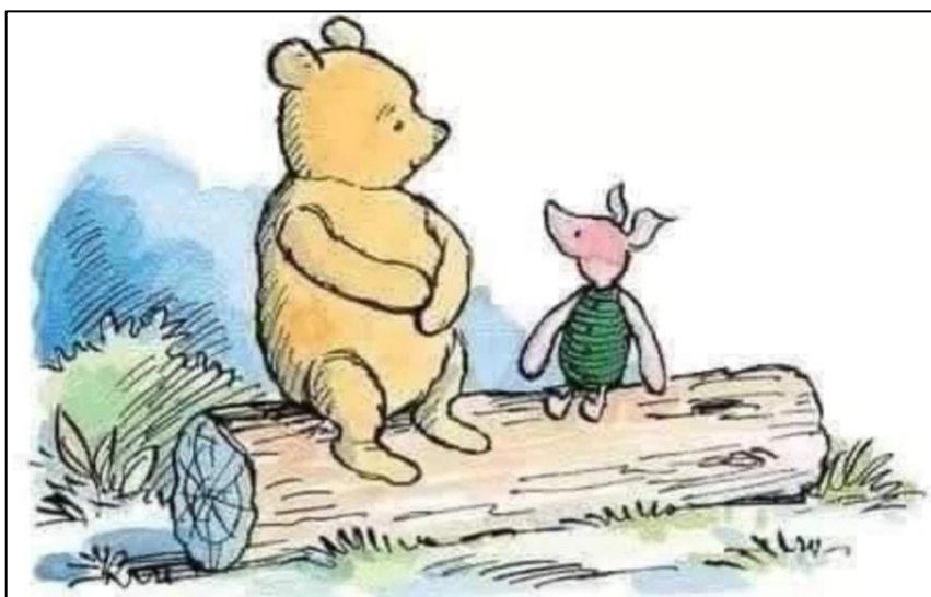
English Literature: A Community 2d · 🌐

Some will see and have the understanding that everything happens for a reason, or it is God’s will. For many this is a comforting thought. However, in my first congregation when a couple’s 12 year old son died they were so angry at God they never came back to church after the funeral. A woman that I visited in the