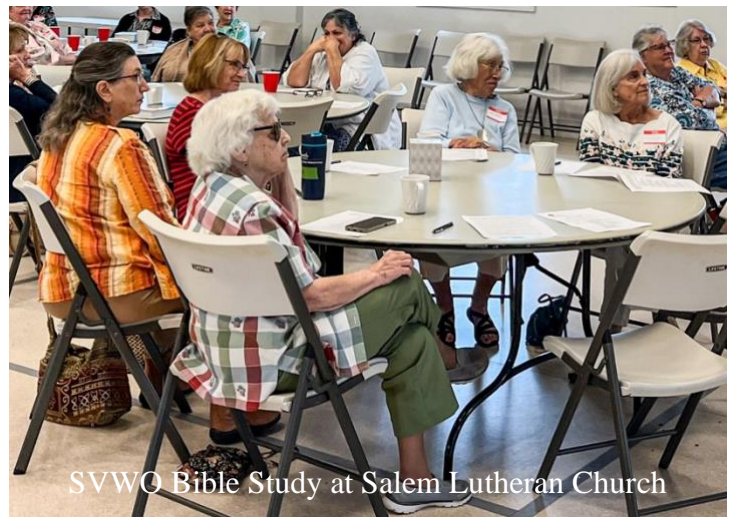
SVWO Bible Study at Salem Lutheran Church

All ladies of St. James belong to our Circle. Please consider joining us for meetings and events.